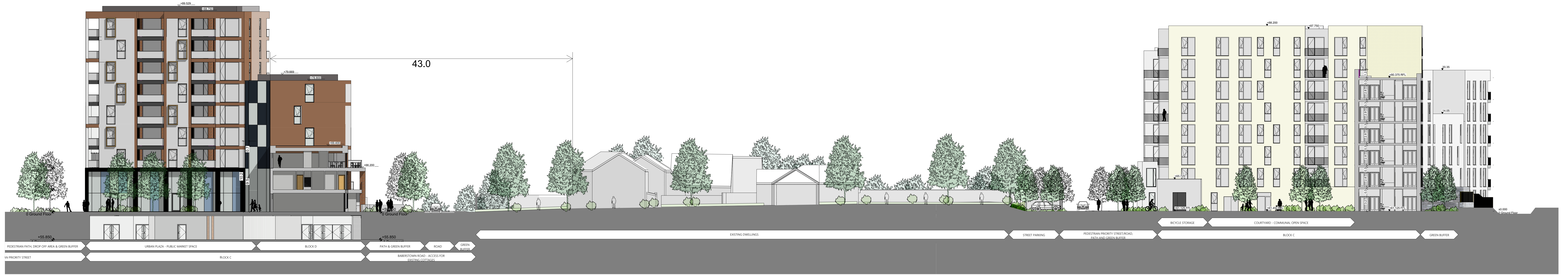
1:200 SECTION A-A SECTION