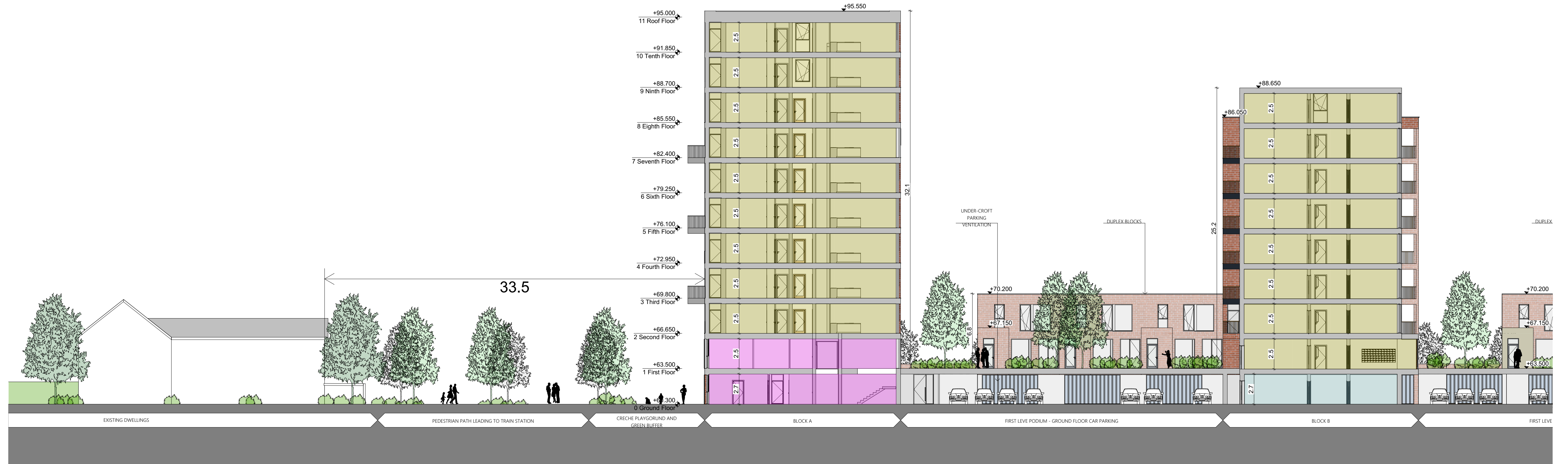
1:200 Section B - B SECTION